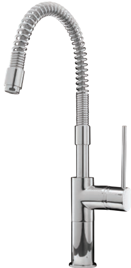
Coil – Single lever COIL/CH