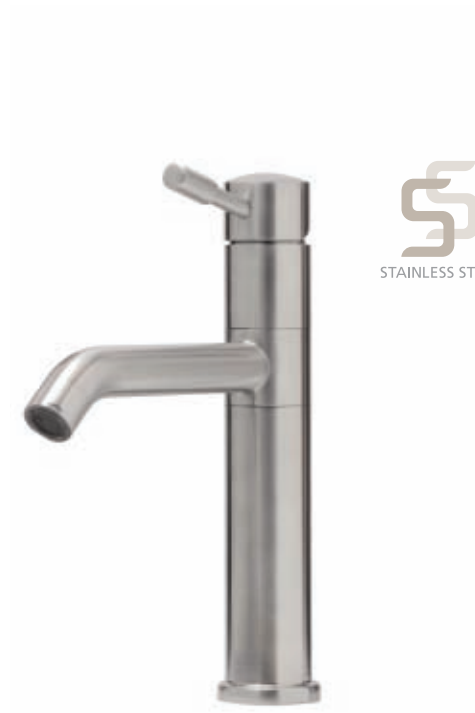
Orion – Single lever ORI2/SS