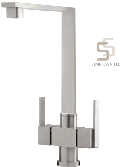
Robo – Monobloc ROB2/SS