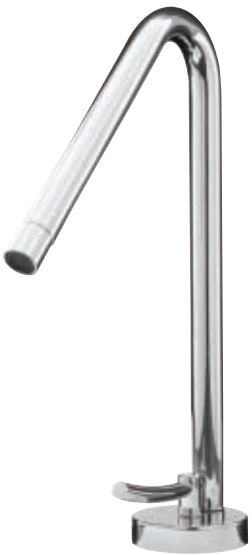
Maestro – Progressive valve MAE/CH