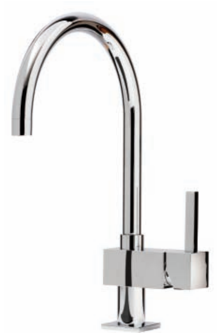
Aries – Single lever ARI/CH