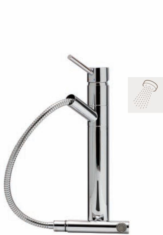
Atlanta Spray – Pull-out spray ATLS2/CH