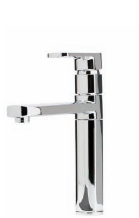
Inca – Single lever INC/CH