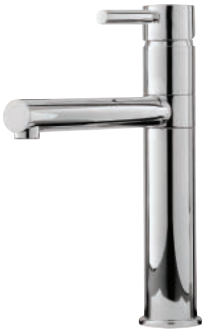
Atlanta – Single lever ATL2/CH