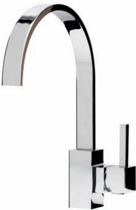
Delta – Single lever DEL/CH