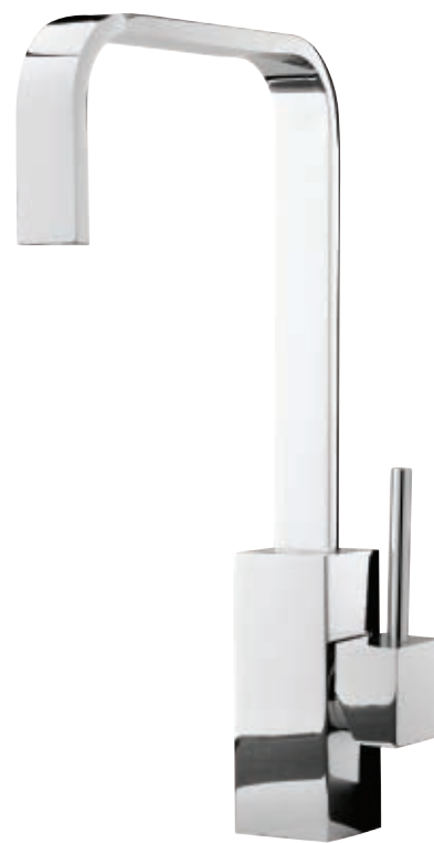
Hawk – Single lever HAW/CH