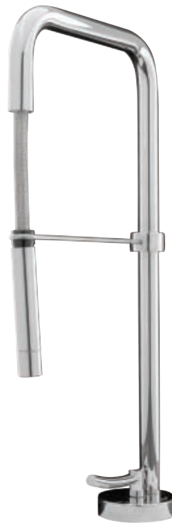
Dali Quad – Progressive valve DAL/CH