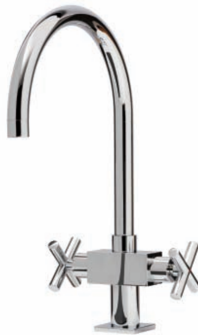
Astrid – Monobloc AST/CH