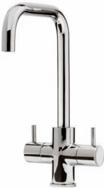
Zuben Quad – Monobloc ZUBQ3/CH