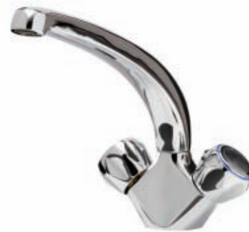
Monobloc – Monobloc MONCOM/CH