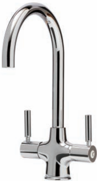
Washington – Monobloc WAS3/CH