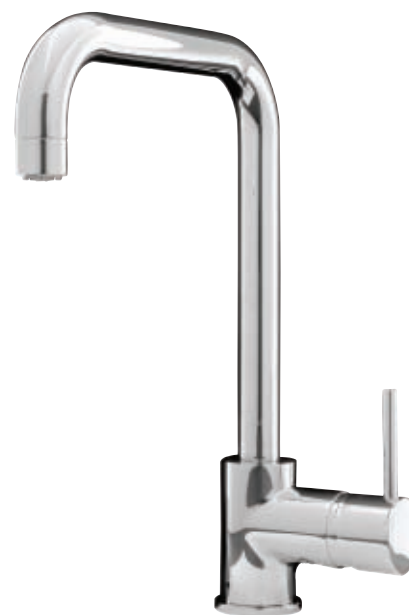
Aspen Quad – Single lever ASPQ2/CH