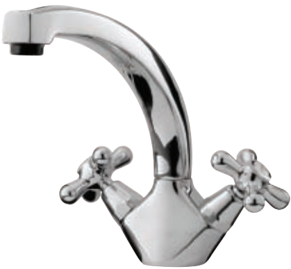
Old Time Ceramic – Monobloc DS/MONDL/CH