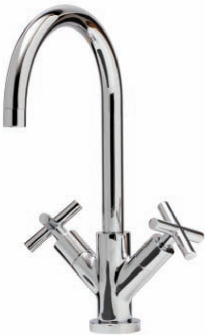
Kontro – Monobloc KON3/CH

General features Monobloc design Polished chrome Minimum 0.3 bar pressure required Quarter turn valve Single flow