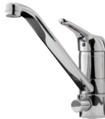
Single Lever 3Flow – Single lever 3FSL/CH