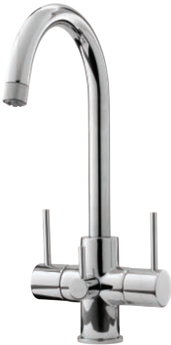
Zuben 3Flow – Monobloc 3FZUB/CH