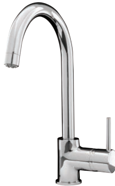
Aspen – Single lever ASP2/CH