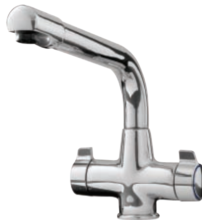
Cruciform – Monobloc CRU/CH