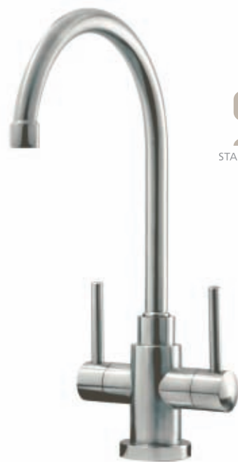
Lamar – Monobloc LAM2/SS