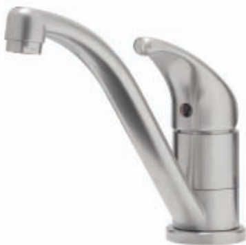
Sigma – Single lever SIG2/SS