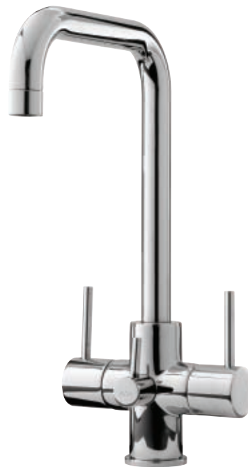
Zuben Quad 3Flow – Monobloc 3FZUBQ/CH