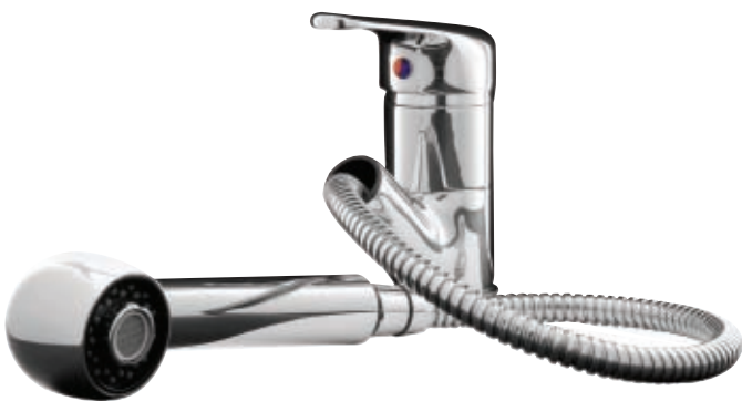
Lever Spray – Pull-out spray SLS2/CH