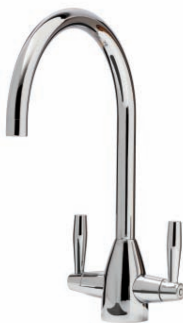
Avel – Monobloc AVE3

General features Monobloc design Polished chrome or brushed nickel Minimum 0.3 bar pressure required Quarter turn valve Single flow