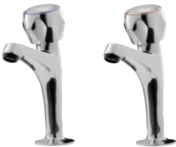
Pillar – Pillar PIL2/CH