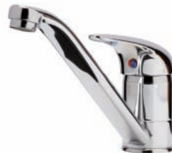
Single Lever – Single lever SL5/CH