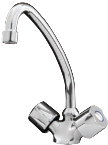
Value Monobloc – Monobloc AVCOM3