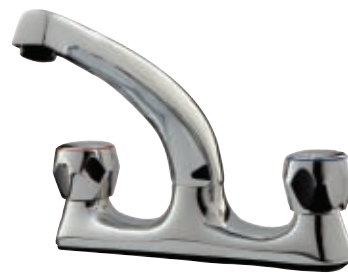
Deck – Deck DEC/CH